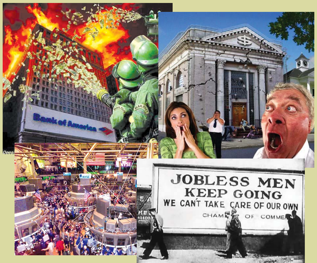
Throwing trillions of dollars at the banks won't save the system See article page 2