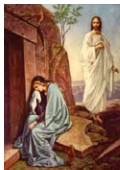
The Resurrection Fruit: Faith