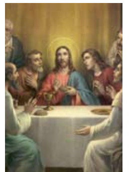
Institution of the Eucharist Fruit: Adoration