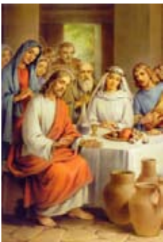
Wedding at Cana Fruit: Proclaiming Heaven