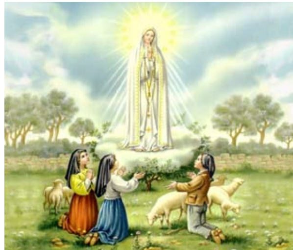
May 13, 2007 was the 90th anniversary of the first apparition at Fatima

This indication is not intended to limit a rightful freedom in personal and community prayer, where