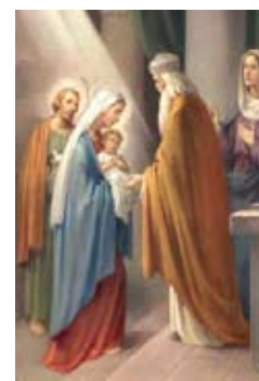
Presentation Fruit: Obedience