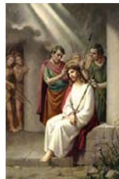
The Crowning Fruit: Courage