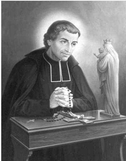
Saint Louis-Marie Grignion de Montfort

In this process of being conformed to Christ in the Rosary, we entrust ourselves in a special way to the maternal care of the Blessed Virgin. She who is both the Mother of Christ and a member of the Church, indeed her “pre-eminent and altogether singular member”, is at the same time the “Mother of the Church”. As such, she continually brings to birth children for the mystical Body of her Son. She does so through her intercession, imploring upon them the inexhaustible outpouring of the Spirit. Mary is the perfect icon of the motherhood of the Church.