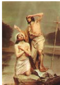
Baptism of Jesus Fruit: Openness