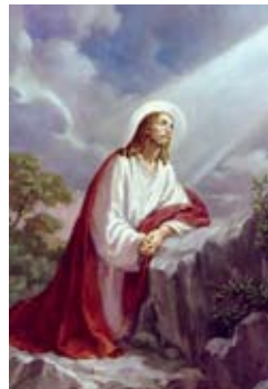
The Agony Fruit: Sorrow for Sin