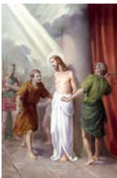
The Scourging Fruit: Purity