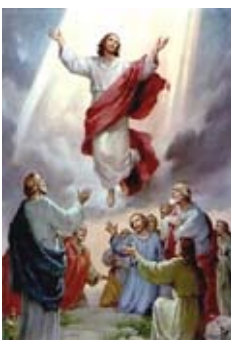
The Ascension Fruit: Hope