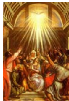
Descent of the Holy Spirit Fruit: Love of God