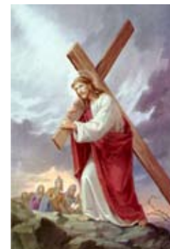
The Carrying Fruit: Patience