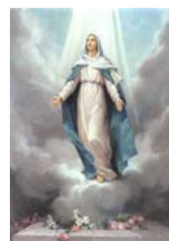
The Assumption Fruit: Grace of a happy death