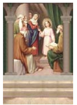
Finding in the Temple Fruit: Joy in Jesus