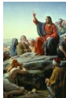
Proclaiming the Kingdom Fruit: Repentance