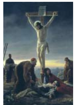
The Crucifixion Fruit: Perseverance