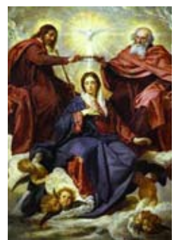
The Coronation Fruit: Trust in Mary