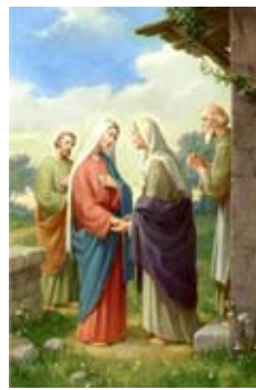
The Visitation Fruit: Love of Neighbor