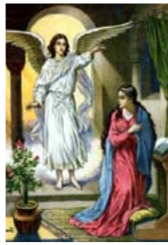
The Annunciation Fruit: Humility