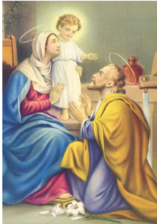
The Holy Family of Nazareth

istry. The revelation made directly by the Father at the Baptism in the Jordan and echoed by John the Baptist is placed upon Mary’s lips at Cana, and it becomes the great maternal counsel which Mary addresses to the Church of every age: “Do whatever he tells you” (Jn 2:5). This counsel is a fitting introduction to the words and signs of Christ’s public ministry and it forms the Marian foundation of all the “mysteries of light”.