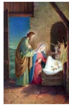
The Nativity Fruit: Poverty