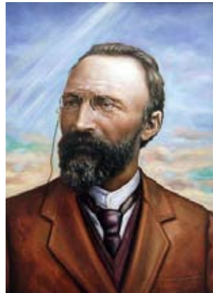
Saint Padre Pio and Blessed Bartolo Longo

As a result, he felt called to build a Church dedicated to Our Lady of the Holy Rosary in Pompei, against the background of the ruins of the ancient city, which scarcely heard the proclamation of Christ before being buried in 79 A.D. during an eruption of Mount Vesuvius, only to emerge centuries later from its ashes as a witness to the lights and shadows of classical civilization. By his whole life's work and especially by the practice of the "Fifteen Saturdays", Bartolo Longo promoted the Christocentric and contemplative heart of the Rosary, and received great encouragement and support from Leo XIII, the "Pope of the Rosary".