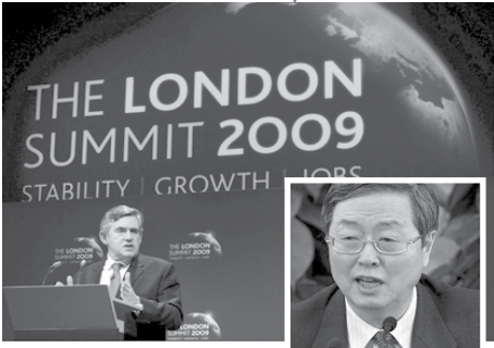
Gordon Brown and Zhou Xiaochuan

RFID chips: Microchips are being imposed on the population for medical purposes, inventory of products, and as a means of guaranteeing the safety of cashless transactions. But we all know that the purpose of this technology is to track every person and item on the planet.