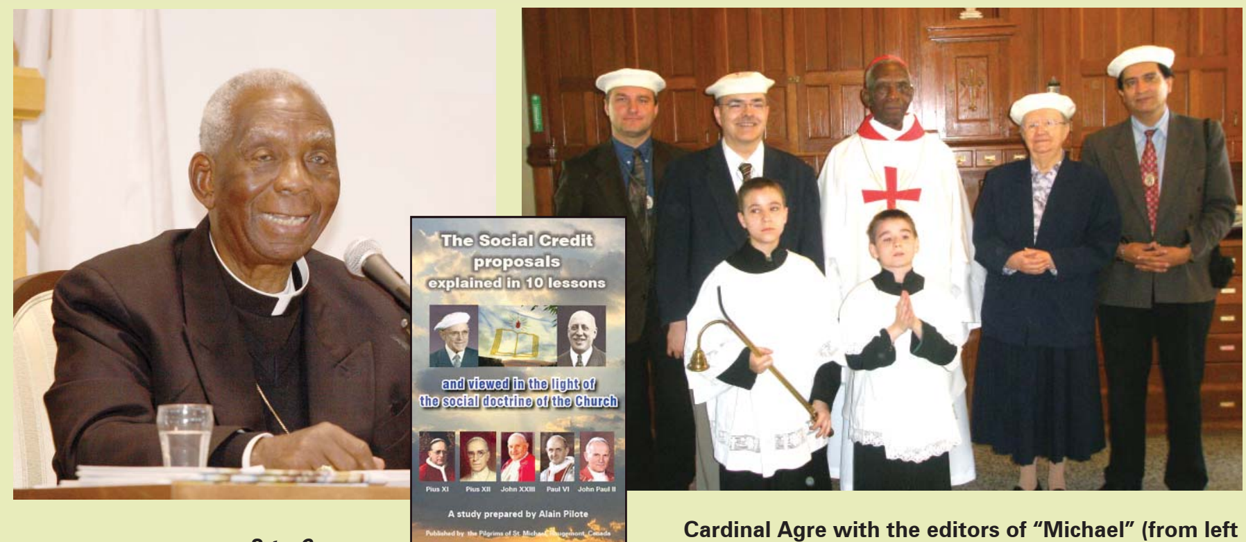
see pages 3 to 6