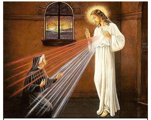
St. Faustina receives a vision of Jesus

"Sister Faustina's canonization has a particular eloquence: by this act I intend today to pass this message on to the new millennium. I pass it on to all people, so that they will learn to know even better the true face of God and the true face of their brethren. (...) Sister Faustina Kowalska wrote in her Diary: 'I feel tremendous pain when I see the sufferings of my neighbors. All my neighbors' sufferings reverberate in my own heart; I carry their anguish in my heart in such a way that it even physically destroys me.