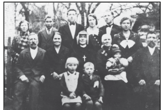
The family of St. Faustina Kowalska

"Eternal Father, I offer You the Body and Blood, Soul and Divinity of Your dearly beloved Son, Our Lord Jesus Christ, for our sins and those of the whole world; for the sake of His sorrowful Passion, have mercy on us" (475).