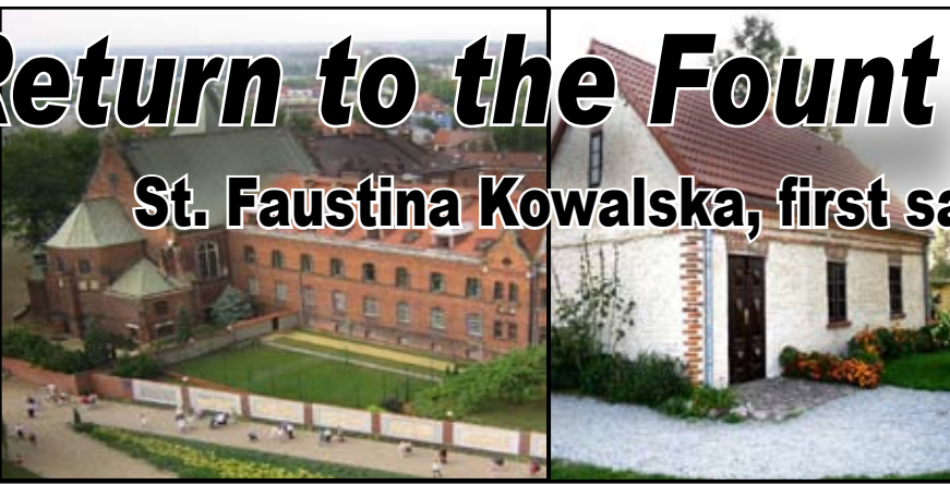
St. Faustina Kowalska, the convent in Lagiewniki, the house in which St. Faustina was born

St. Faustina Kowalska, first saint of the third millennium